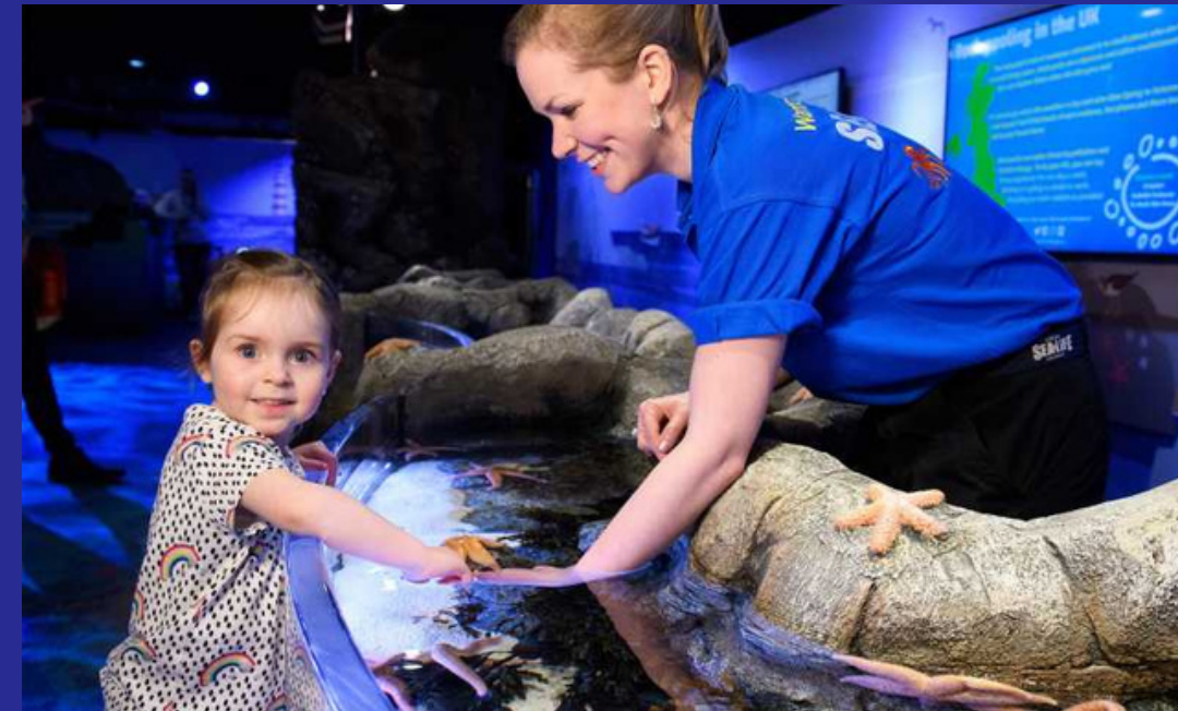
A rockpool area