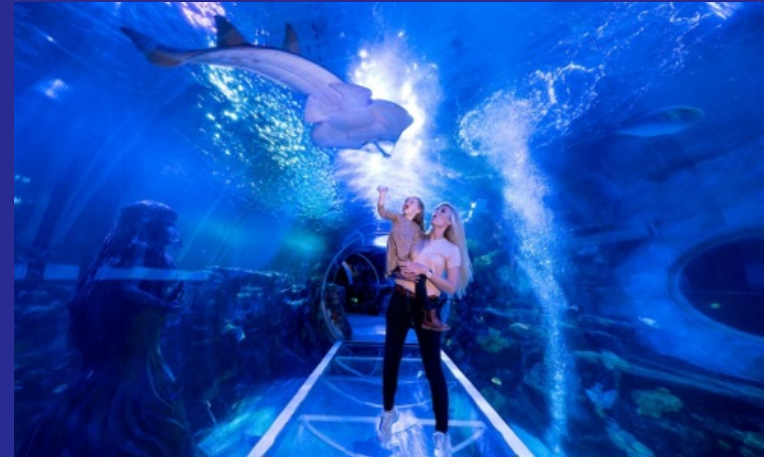
A tunnel you can walk through