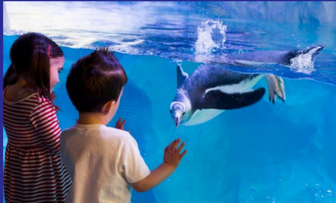
Lots of water and blue lights