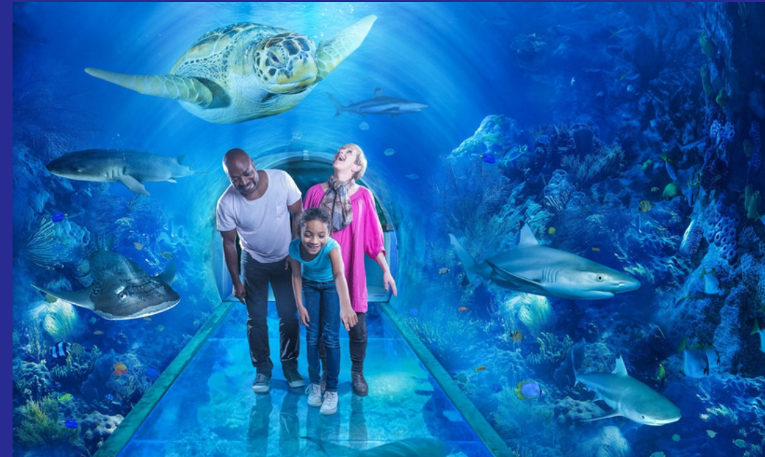
The fish and animals