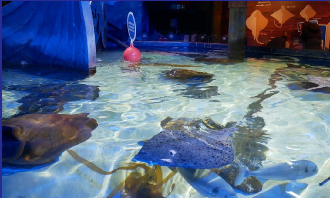
A seaside smell (shells)