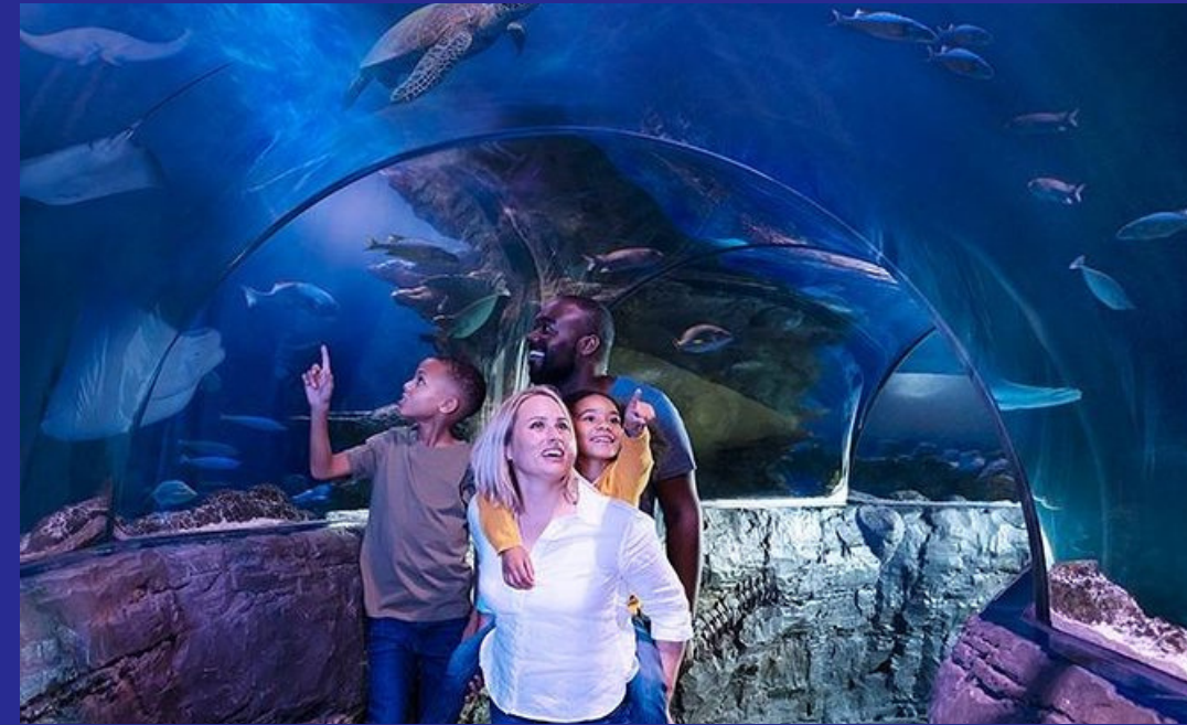
A tunnel you can walk through