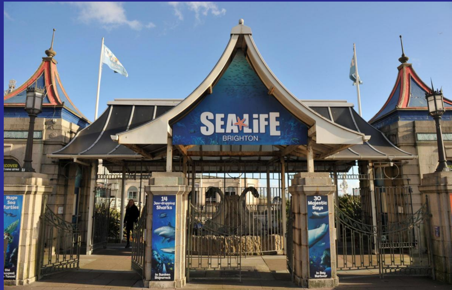
A big blue entrance

When I visit the SEA LIFE Centre, outside I might see