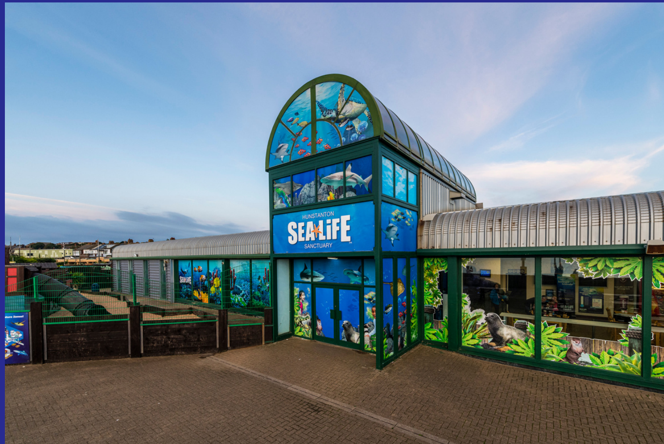
A big blue entrance

When I visit the SEA LIFE Centre, outside I might see