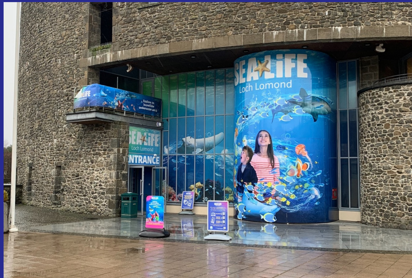
A big blue entrance

When I visit the SEA LIFE Centre, outside I might see