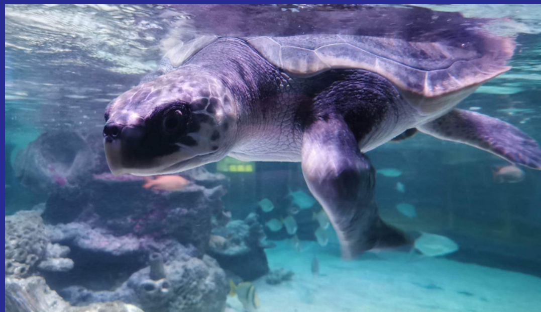
Lots of water and blue lights