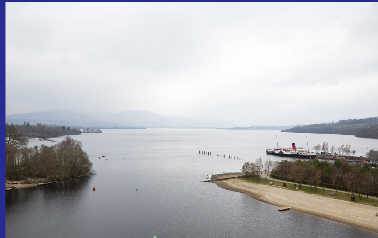
A view of the Loch