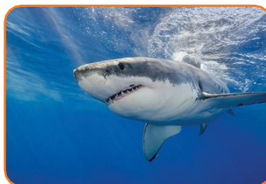
Great White Shark