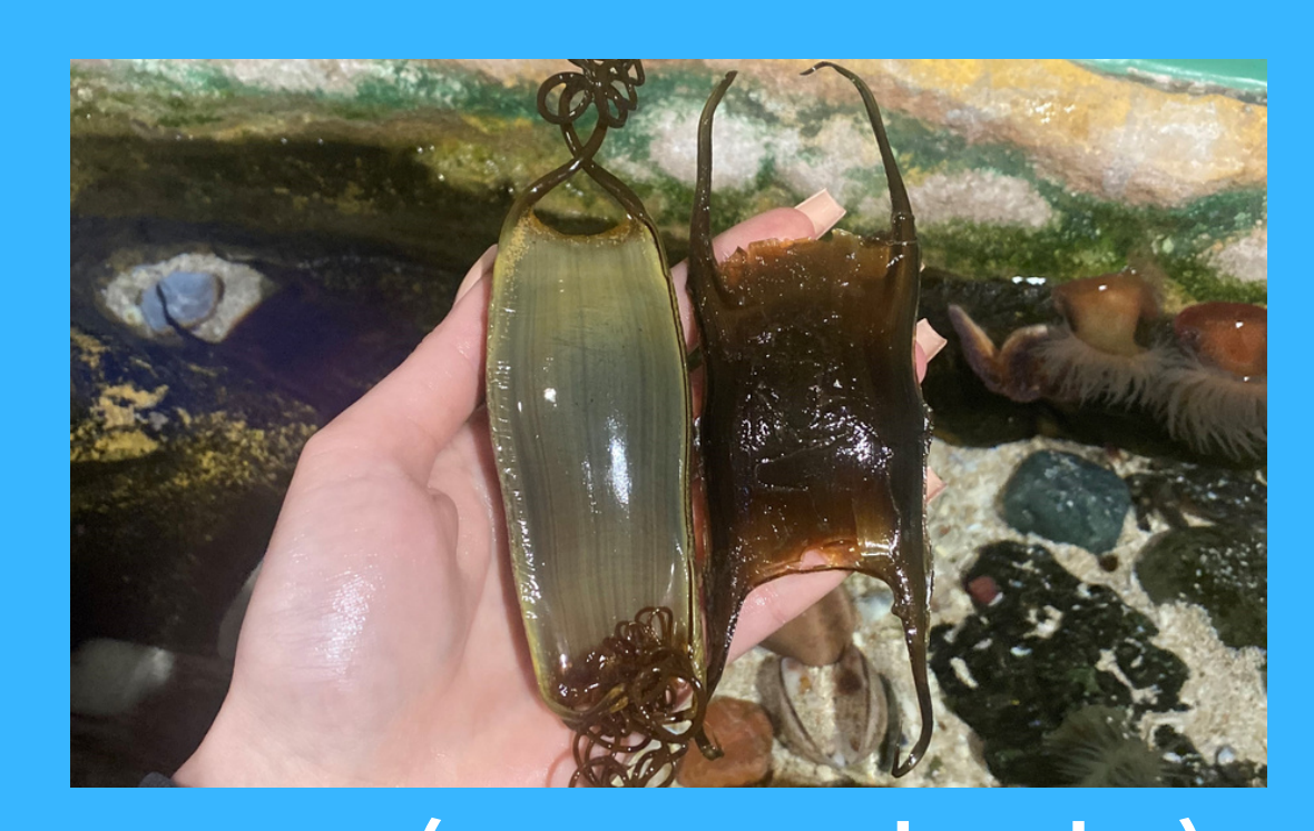
eggs (rays or sharks)