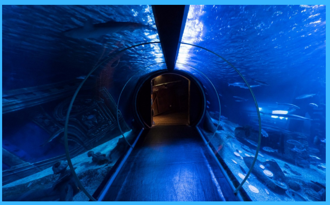
an ocean glass tunnel