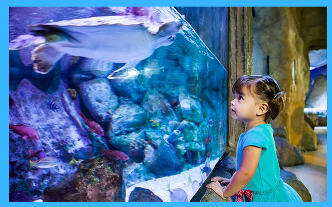
the sound of water