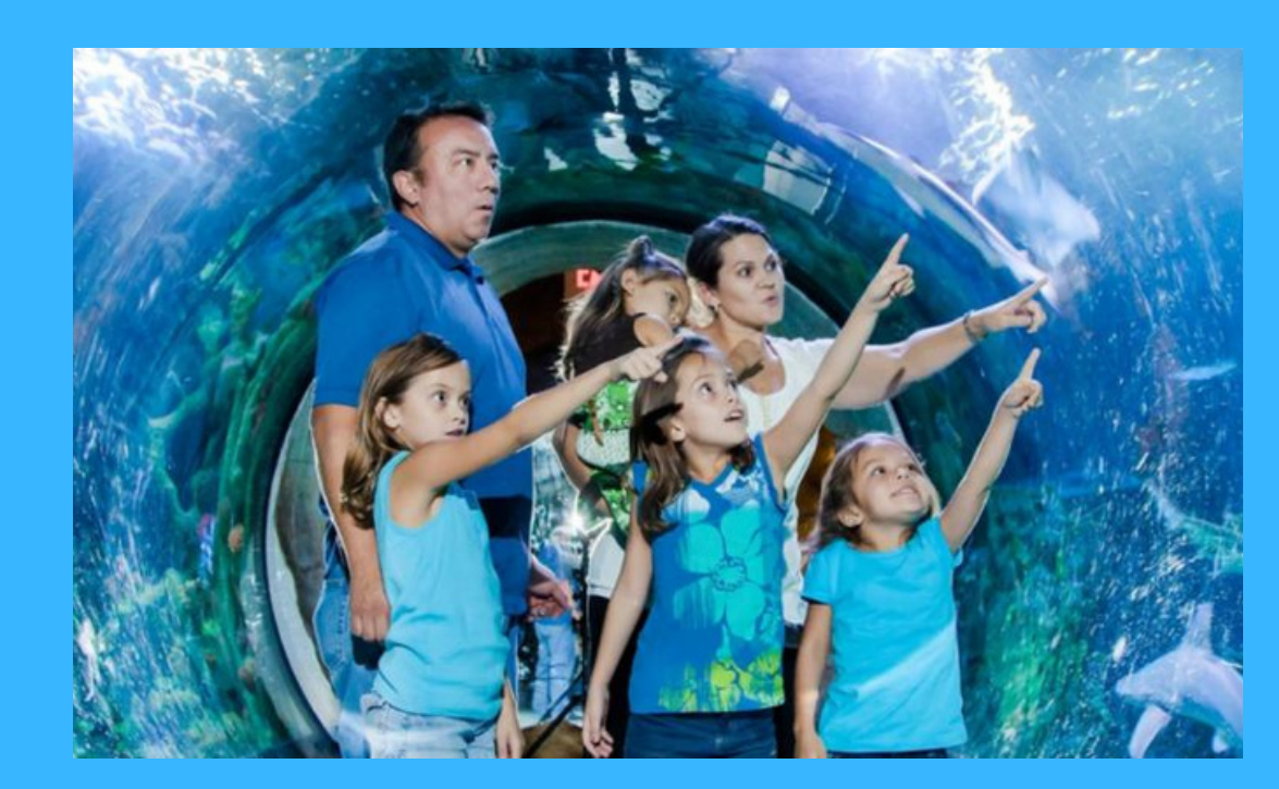
the voices of other children