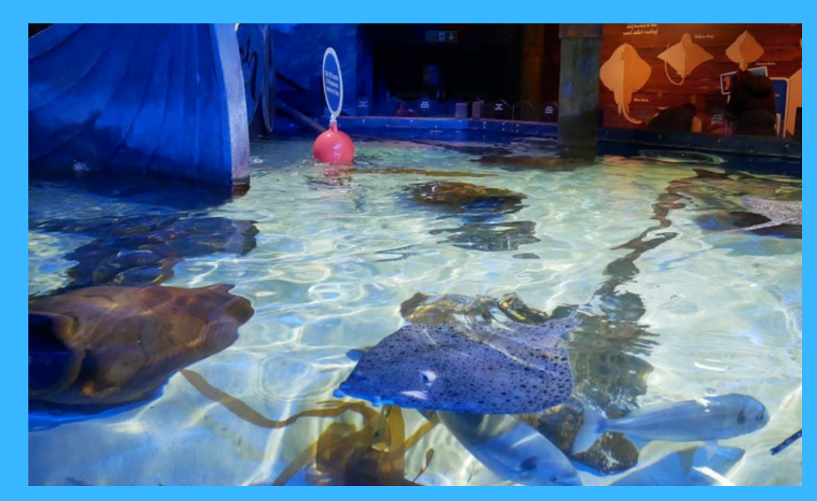
the smell of the seaside