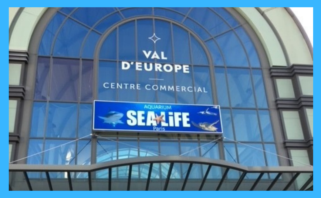
a big signage