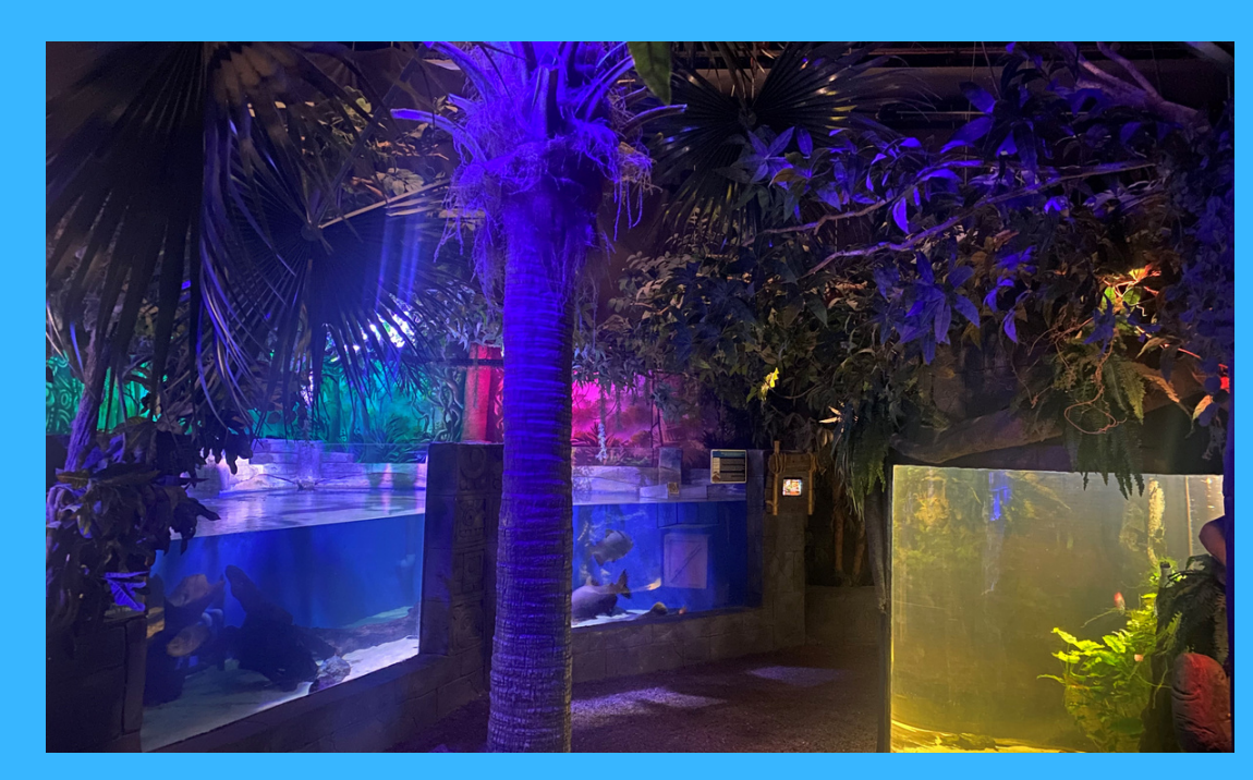
the humidity of the Amazonia