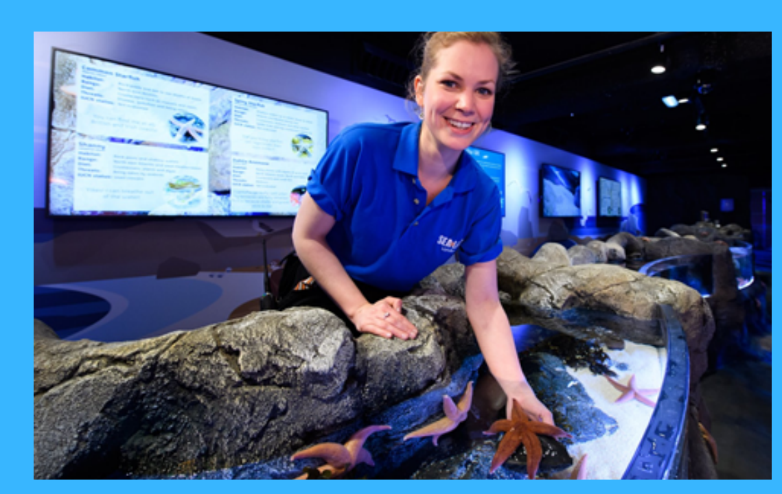
a speech by a member of the team