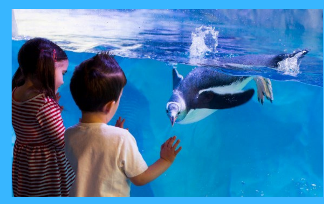
lots of water and blue lights