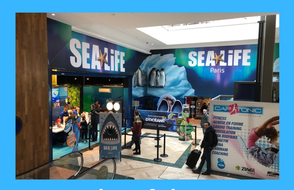
a colourful entry