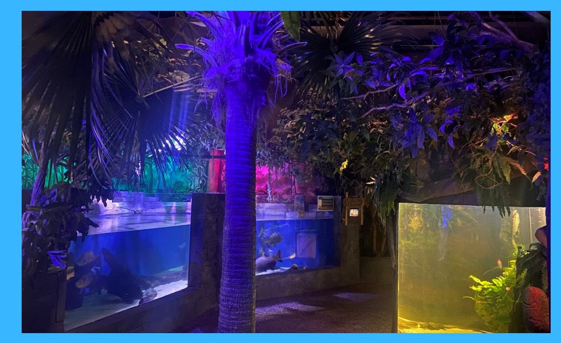
some special effects (Amazonia area)