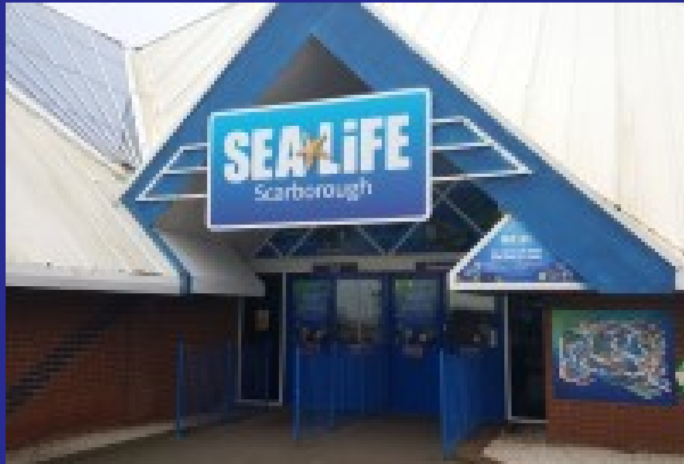
A big blue entrance

When I visit the SEA LIFE Centre, outside I might see