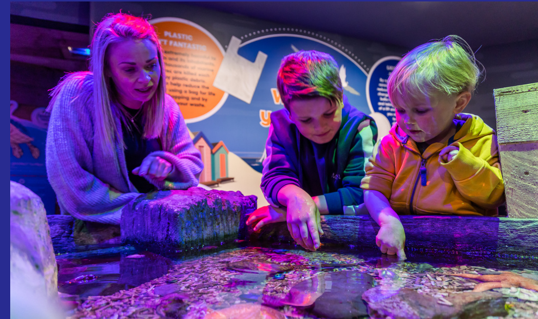
The fish and animals