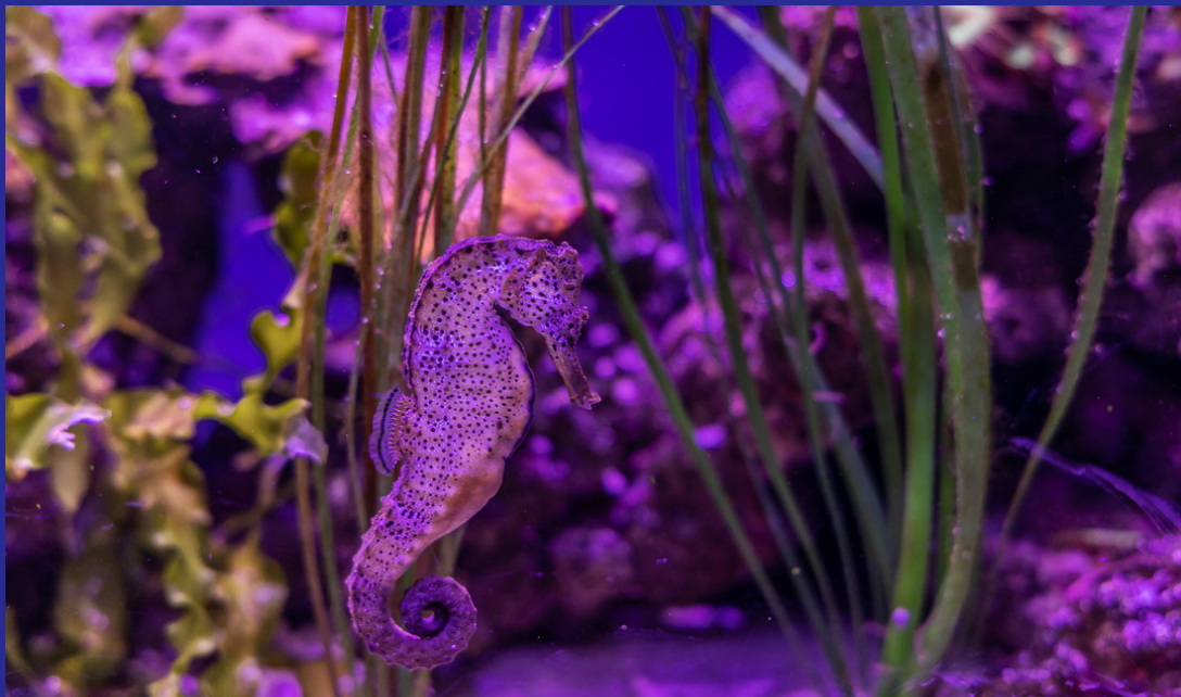
A seaside smell (shells)