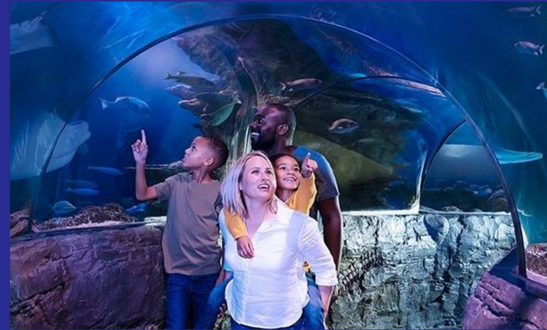
A tunnel you can walk through