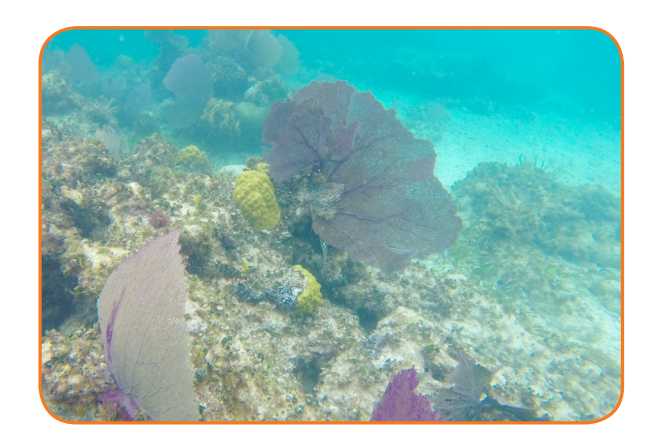
Healthy / Unhealthy

The Great Barrier Reef is currently under threat due to coral bleaching. Label which reef you think is healthy and which reef is unhealthy?