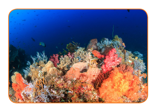
Healthy / Unhealthy