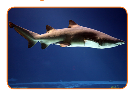
Endangered / Extinct