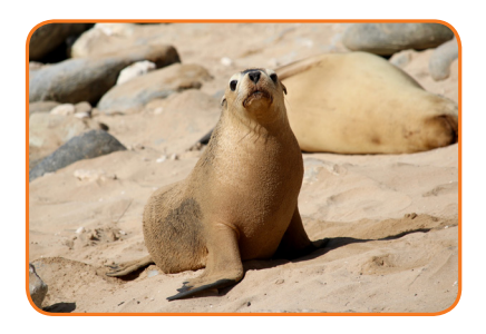
Endangered / Extinct