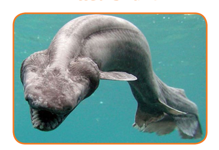
Endangered / Extinct