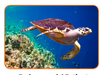
Endangered / Extinct